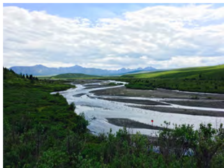
Savage River , Denali National Park