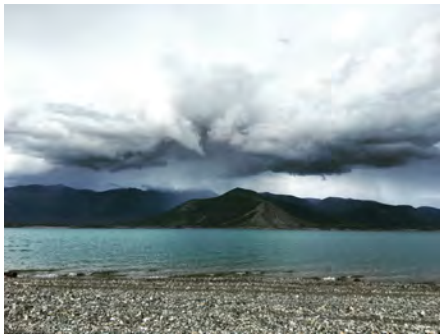
Klauene Lake , Yukon Territory

Then there is Alaska. Denali National Park, so vast and stunning, words cannot describe. Wrangle-St. Elias, a range of mountains with snow capped peaks and endless hiking. It's a photographer's dream. The Kenai Peninsula with its stunning glaciers and coastal views. Quaint villages, fascinating history and wonderful characters are all part of the Alaska adventure.