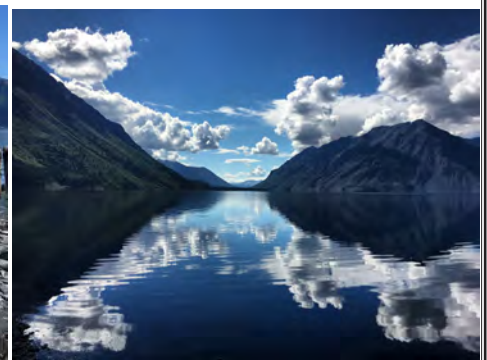
Kathleen Lake , Klauene National Park and Refuge